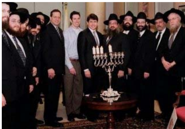
Governor of Illinois, Rod Blagojevich

...Receives a Jewish Menorah on the steps of the State Capitol, again, from representatives of the Lubavitch Movement.